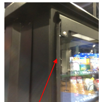
New high security lexan outer cover