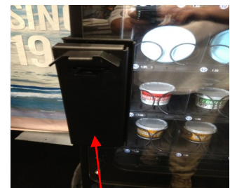
New high security lock cover

Refrigeration Super 1/2 HP, R134a Closed System