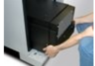
Easy to remove refrigeration