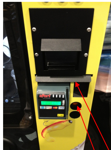
New ADA compliant payment area and new electronic coin return