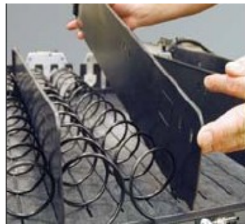
Adjustable Large & Small Selections Configurable to almost any package size with no need for tools