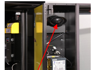
Security alarm system