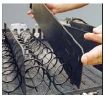
Adjustable Large & Small Selections Configurable to almost any package size with no need for tools