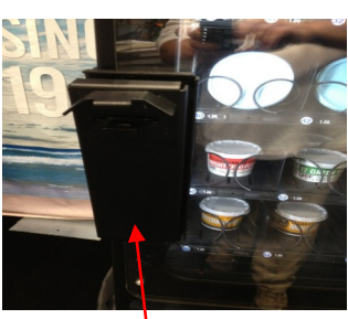
New high security lock cover

Refrigeration Super 1/2 HP, R134a Closed System