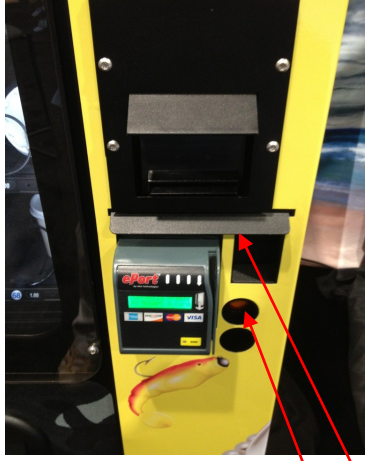
New ADA compliant payment area and new electronic coin return