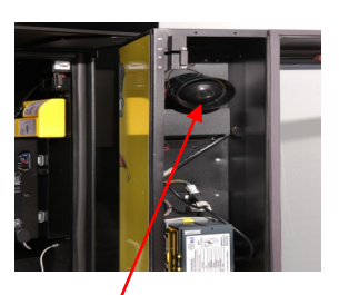
Security alarm system