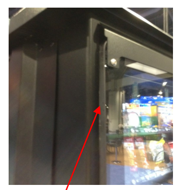
New high security lexan outer cover