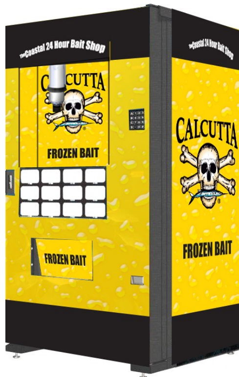
Calcutta graphic choice