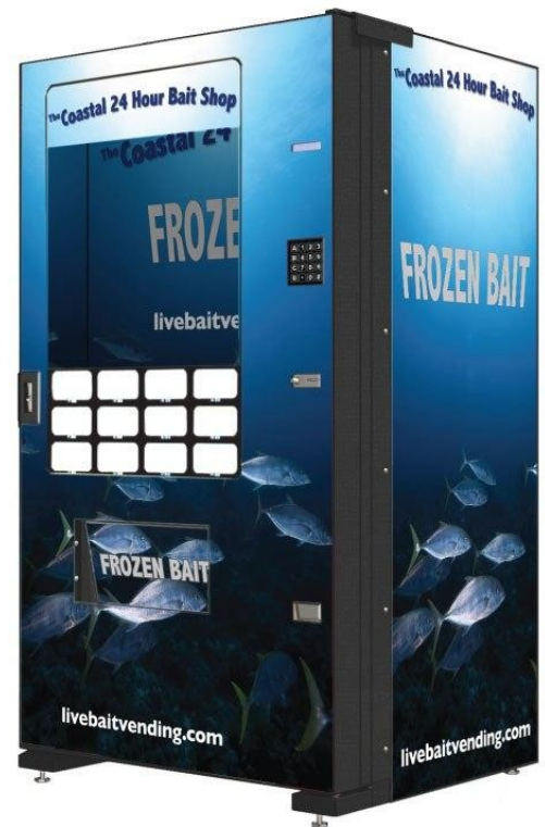
Blue graphic choice

If you are a store owner who wants to increase sales and profits, then our Coastal 24 Hour Bait Shop is the sales tool for your business. The Coastal will sell your frozen bait products 24/7. Customers won't have to go elsewhere to get their bait when your store is closed.