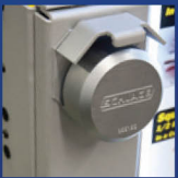
High security lock.