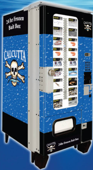
High impact graphics and lighted menu get customer's attention from a distance.

Give your customers what they want, when they want it!