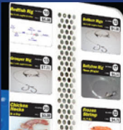
Lighted menu board with product view screen.