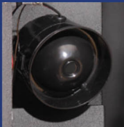
Independent internal alarm system.