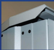
Interlocking door, rain guards & pry covers.