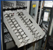
Reconfigurable trays pull out for quick re-stocking.