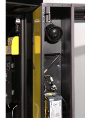
Security alarm system

Please note, vendor will ship as a frozen machine top and bottom