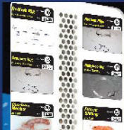
Lighted menu board with product view screen.