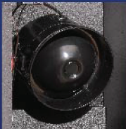
Independent internal alarm system.