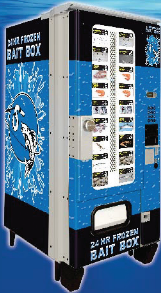
High impact graphics and lighted menu get customer's attention from a distance.

Give your customers what they want, when they want it!