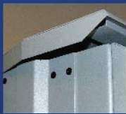
Interlocking door, rain guards & pry covers.