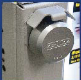
High security lock.